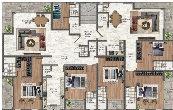
EMIOLA MEWS BLOCK OF APARTMENTS -Third Floor Plan